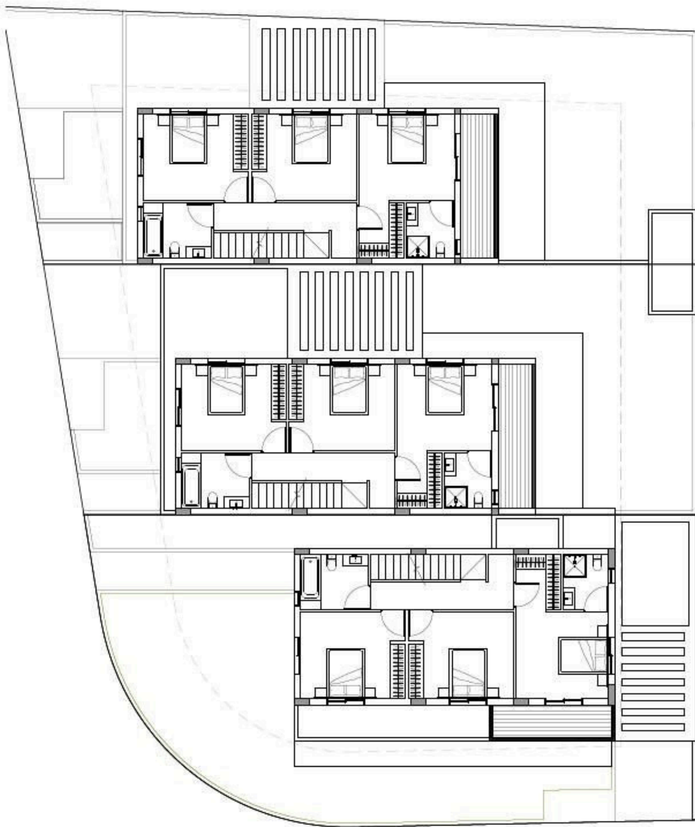
ΟΙΚΟΠΕΔΟ 1 - ΟΡΟΦΟΣ