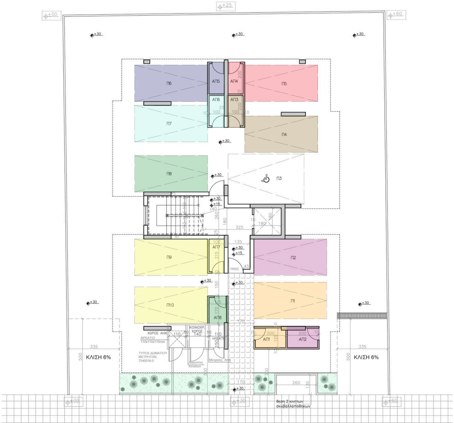
ΚΑΤΟΦΗ ΙΣΟΓΕΙΟΥ scale 1:100