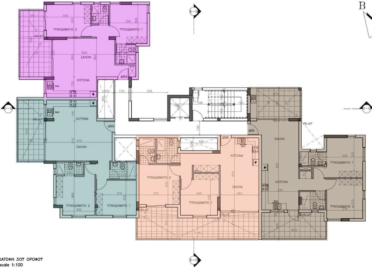
ΚΑΤΩΗ 30Τ ΟΡΟΦΟΤ scale 1:100