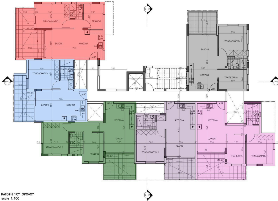
ΚΑΤΩΗ 10Τ ΟΡΟΦΟΤ scale 1:100