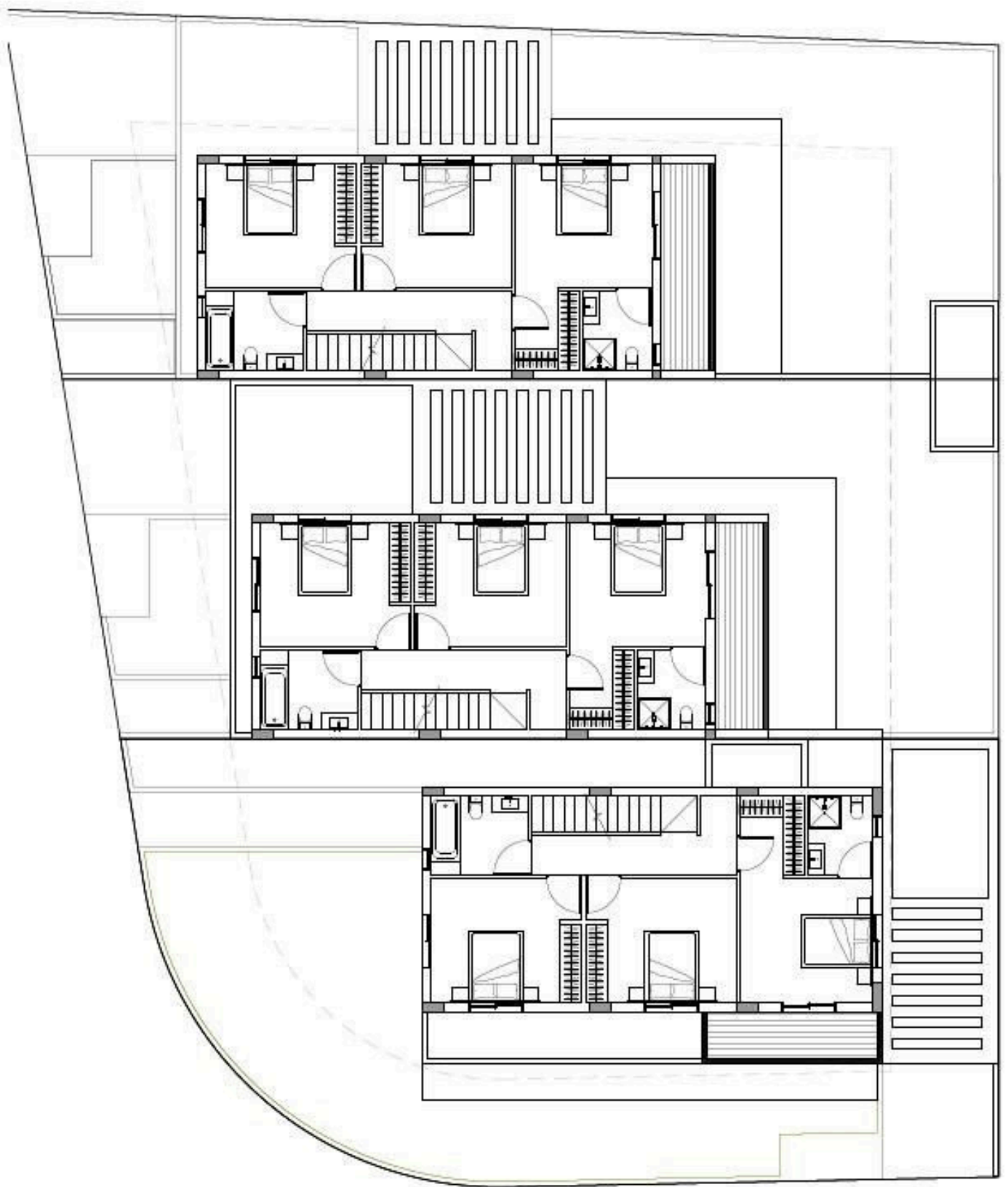
ΟΙΚΟΠΕΔΟ 1 - ΟΡΟΦΟΣ