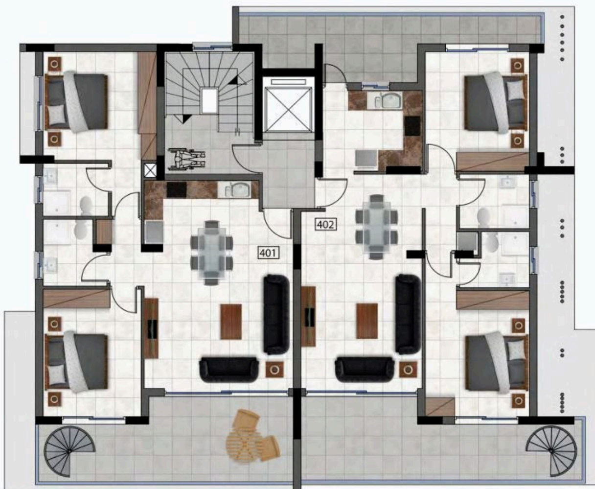
ΚΑΤΟΨΗ 4ου ΟΡΟΦΟΥ