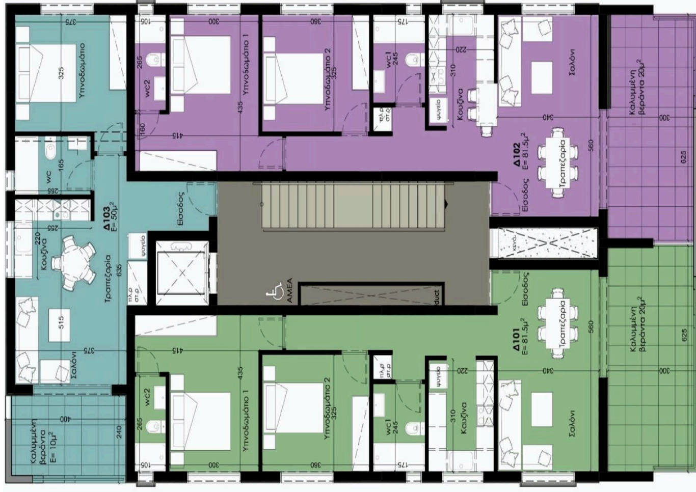
Κάτοψη 1ου ορόφου