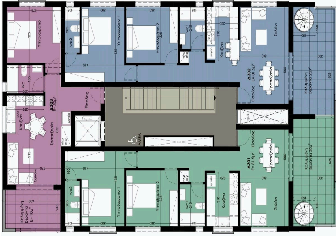
Κάτοψη 3ου ορόφου