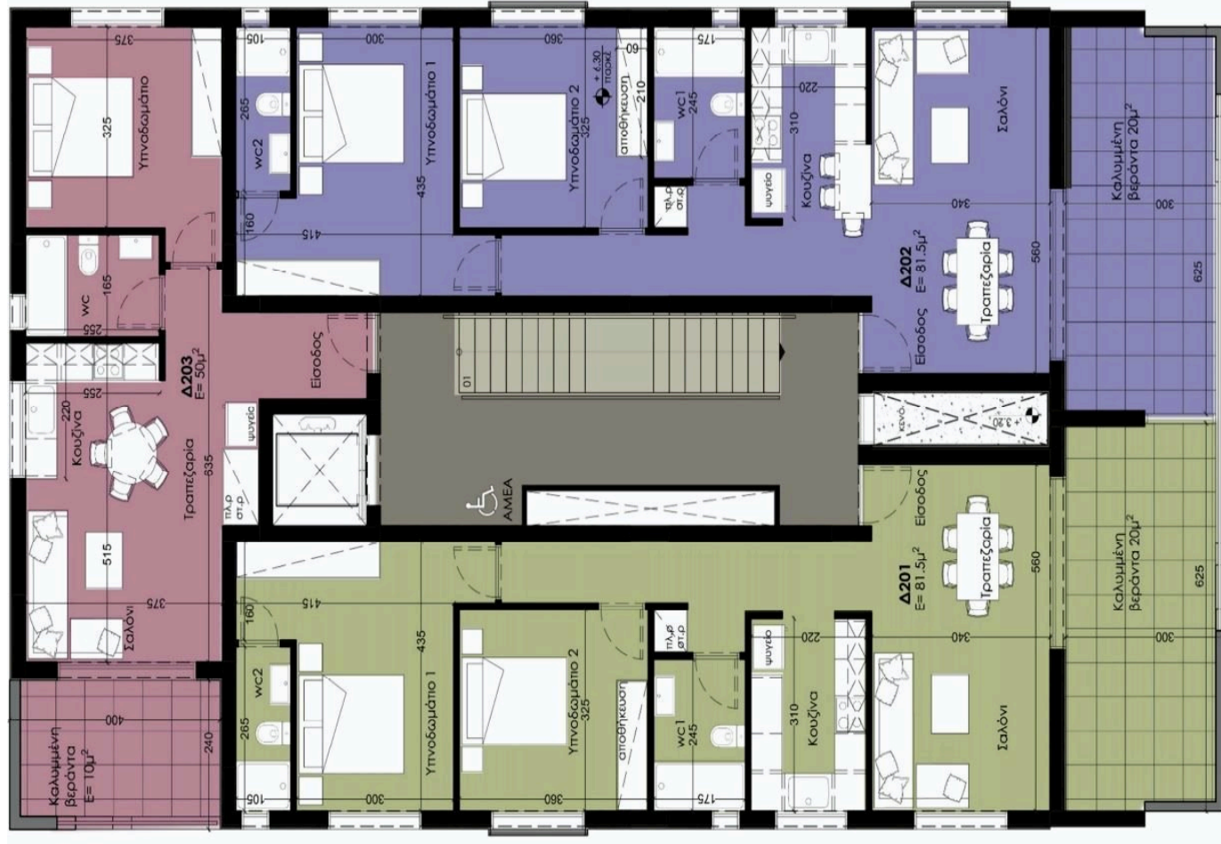
Κάτοψη 2ου ορόφου